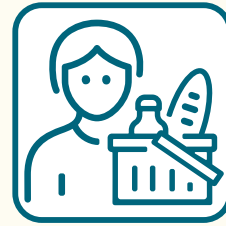
Economic Stability (Including Food Insecurity, Housing & Homelessness)