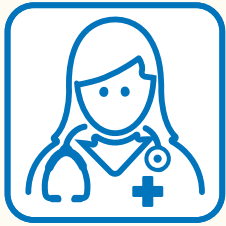
Healthcare Access & Delivery (Including Oral Health)

$7.6 Million invested to address unmet health needs and improve the health of the people in our community.