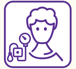
Chronic Conditions (Other than Diabetes & Obesity)