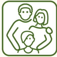
Behavioral Health (Including Domestic Violence & Trauma)